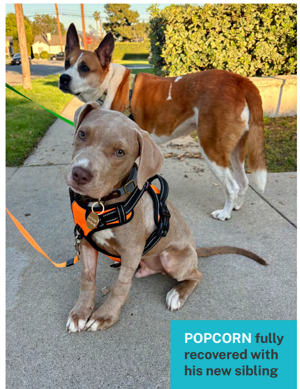
POPCORN fully recovered with his new sibling