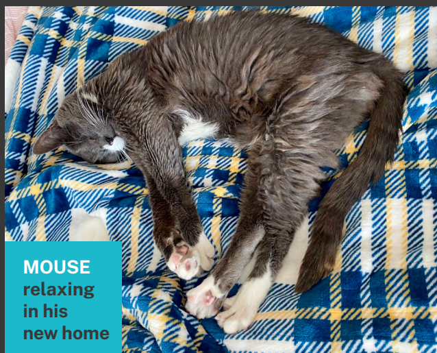
MOUSE relaxing in his new home

Thanks to your steady support, seniors like Mouse receive the love, medical care, and individualized attention they need.