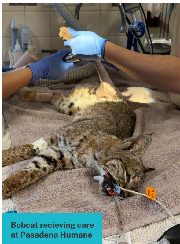
Bobcat receiving care at Pasadena Humane

Your support makes second chances like this possible, for wildlife and companion animals alike.