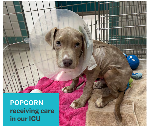
POPCORN receiving care in our ICU

When a fragile life is hanging in the balance, emergency surgeries, intensive care, and lifesaving diagnostics can be critical. Thanks to the resources provided by your support, we never hesitate to act.