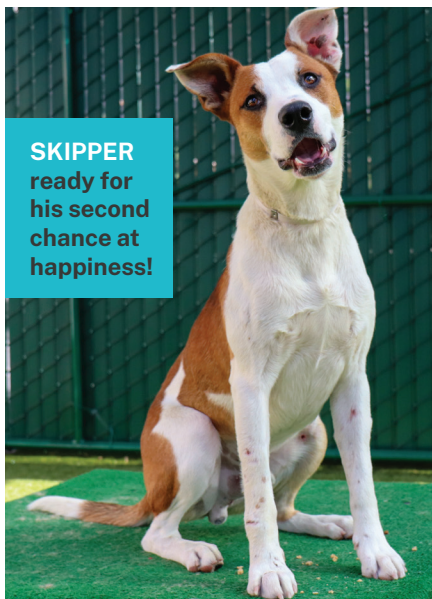
SKIPPER ready for his second chance at happiness!

Skipper had been found running along the side of a busy road, unable to put weight on his front leg. His body was covered in lacerations and painful puncture wounds. While we didn't know how Skipper ended up in this heartbreaking state, we knew that he desperately needed our help.