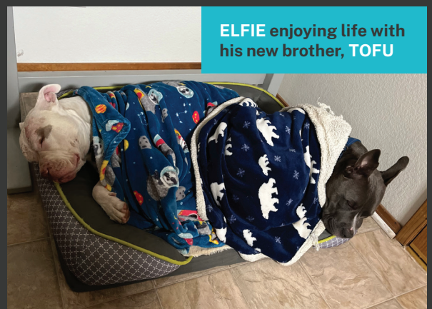
ELFIE enjoying life with his new brother, TOFU