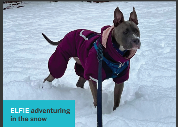
ELFIE adventuring in the snow

Before long, the Trial Adoption became official, and Elfie had finally found his forever home!