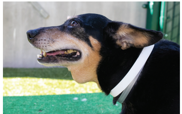
CLYDE came to Pasadena Humane suffering from a rare, life-threatening condition.

It wasn't long before Clyde, and his sister, Bonnie, were adopted by a wonderful family of their own. It is thanks to your support that Clyde got the second chance that he deserves.