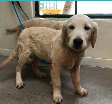
BRUNO arriving at Pasadena Humane