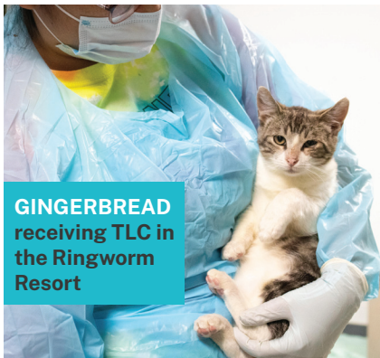
GINGERBREAD receiving TLC in the Ringworm Resort