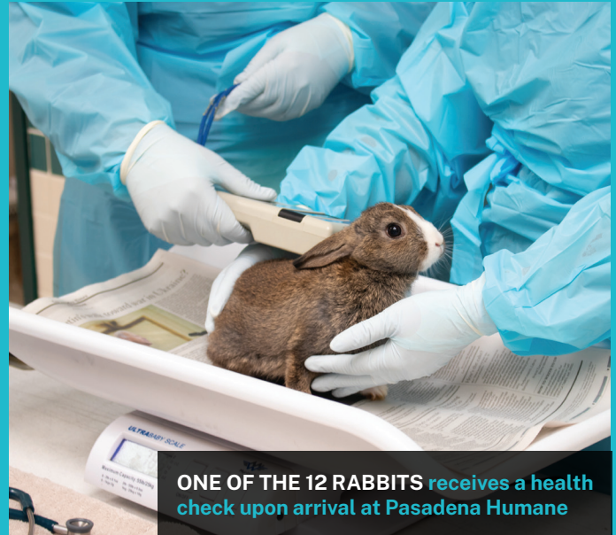
ONE OF THE 12 RABBITS receives a health check upon arrival at Pasadena Humane

Find Tracy and Lacey's happy adoption photo on pg. 2!