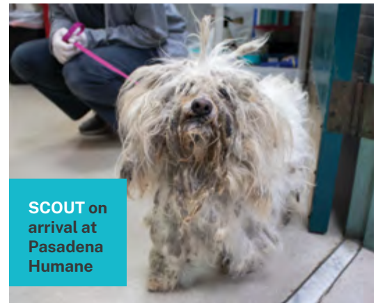
SCOUT on arrival at Pasadena Humane

Scout has come so far since his first day at the shelter. Thanks to the generosity of supporters like you, Scout not only received the medical attention he needed, but is now living a happy life in a loving home.